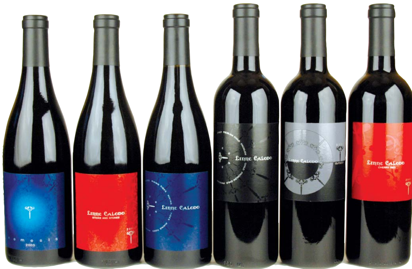
The Linne Calodo labels are a good example of creative design ideas and sophisticated printing techniques.