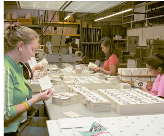
Individual wine labels are hand inspected to ensure quality control.